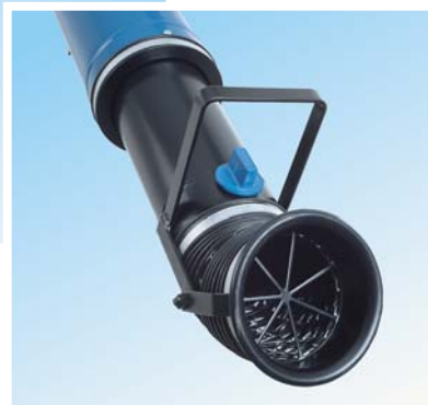
Suction nozzle with damper and 360° swivel

Movex also offers a range of fans, accessories and automatic control devices for our local extractors.